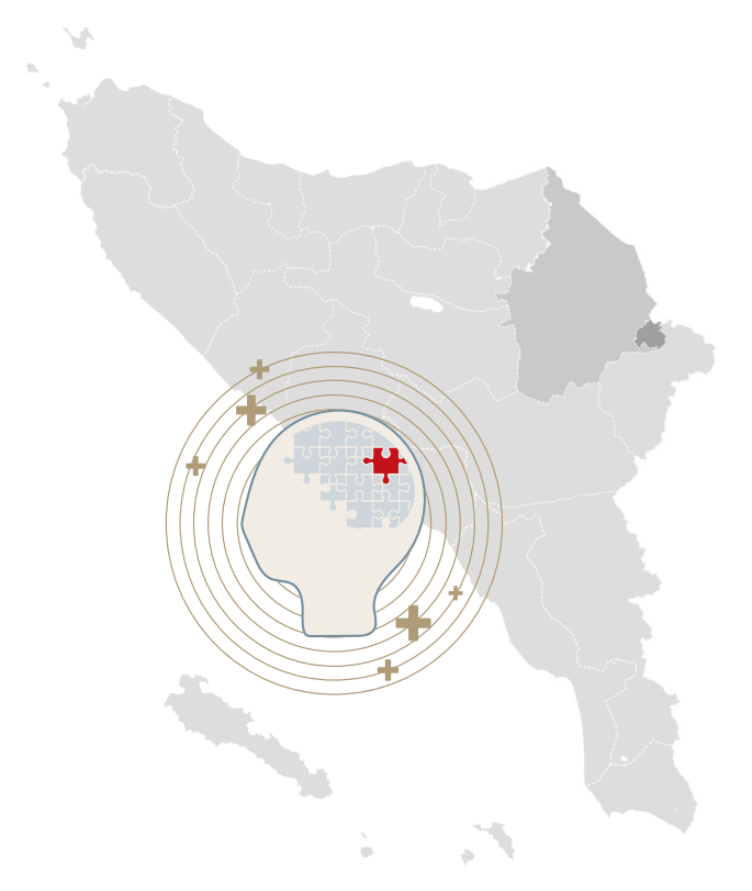
The Aceh model has improved understandings about how to best support people with psychosocial disabilities at all levels, from the provincial government down to communities and individuals.

Following CBM's phase out in 2021, understandings about a social-medical approach to supporting people with psychosocial disabilities remains evident at all levels of the Aceh Model, from the provincial government down to individuals and communities. Government health systems are stronger and a continuity of care between families through to specialised health services at provincial level has been modelled. Gaps in the Aceh Model are due to lack of skilled medical personnel, mainly at the District Hospital level.