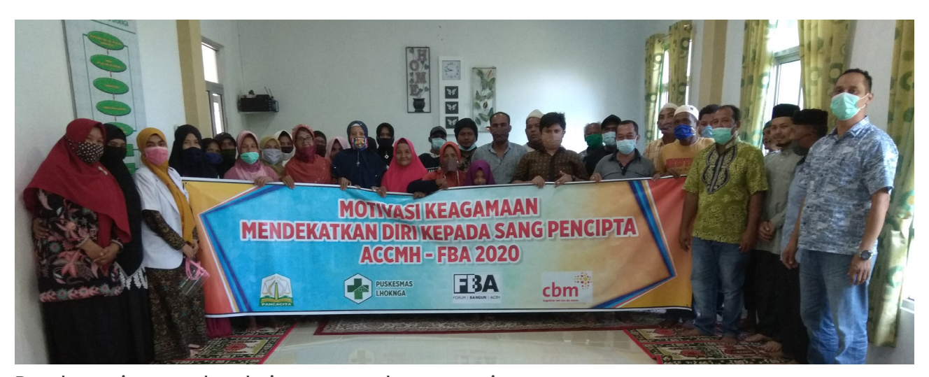
People coming together during a group therapy session.

CBM's work did not focus on getting regional regulations (peraturan daerah or perda) in place regarding mental health. This has impeded an ongoing mandate regarding budgeting in the health system for mental health activities and resulted in the failure of ongoing cross-departmental coordination. Getting regulations changed is not a result easily achieved within a project's average life cycle (3-5 years), but in hindsight, CBM should have focussed on the "long game" and worked with other organisations and advocates to push for this. CBM's mental health work in other provinces has recognised this and incorporated this into their longer-term planning.