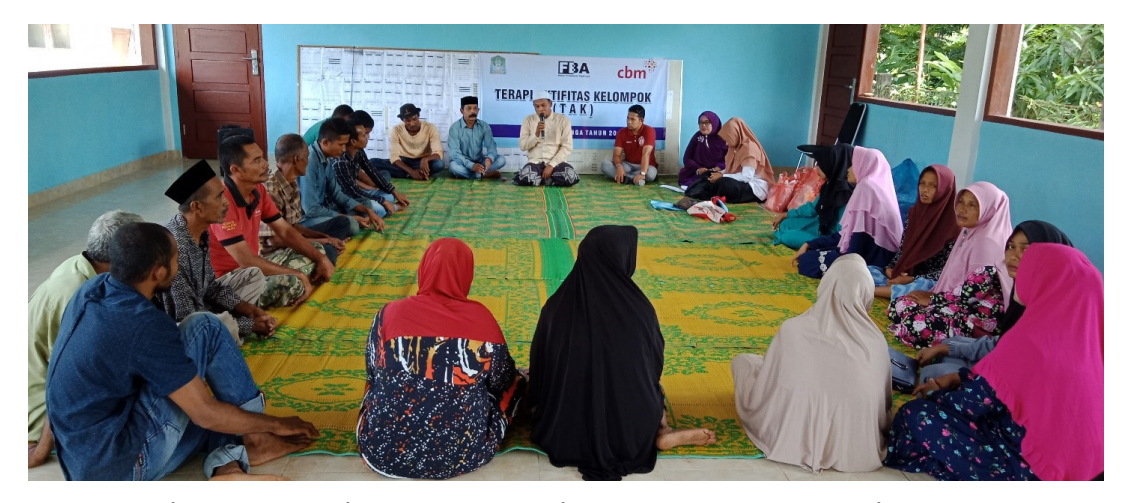
People talking about their challenges during a group therapy session.

CBM recognised that the District Health Office could be more effective in addressing mental health conditions by promoting a multisectoral approach that involves collaboration with other willing government departments, that engaged social workers or women's affairs officers. Unfortunately, due to decrees from governors that separated departmental cooperation and a lack of strong champions within government that could advocate for change, this was not successful. The small efforts that were successful to coordinate with the Social Affairs Department will not be sustained, due to fundamental differences in approach between the health and social affairs departments in the province.