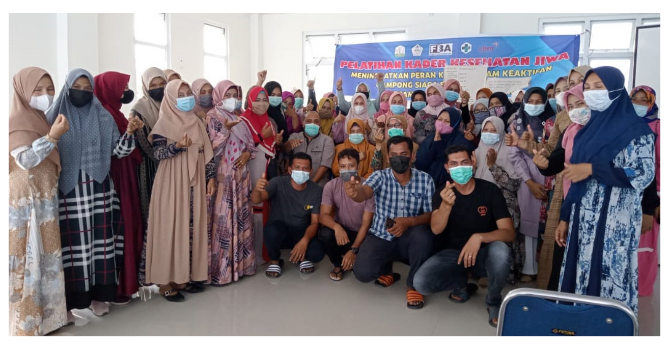
Training mental health volunteers to support mental health in their communities.